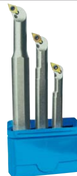
Fig.: Versión a la derecha Suministro sin plaquitas de corte.